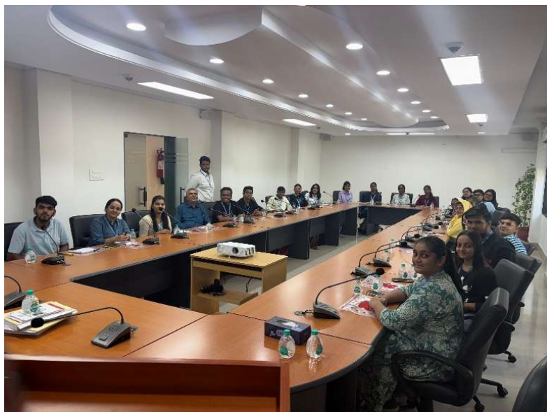
Student of Commerce Association