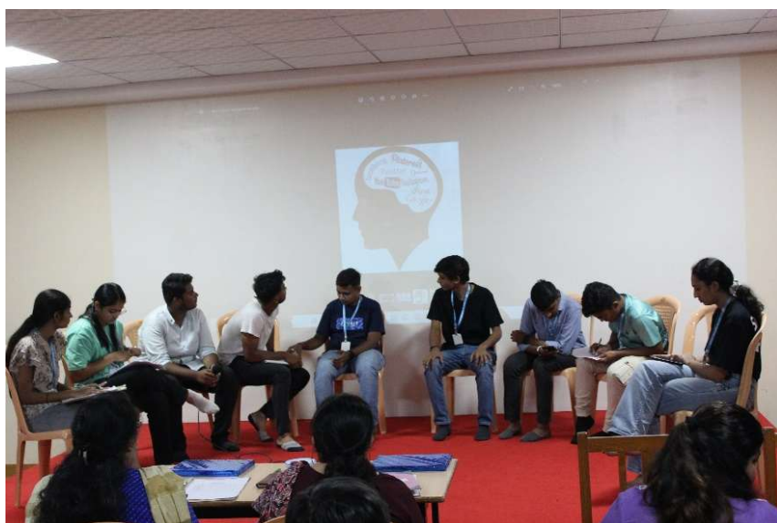
Team of Group Discussion