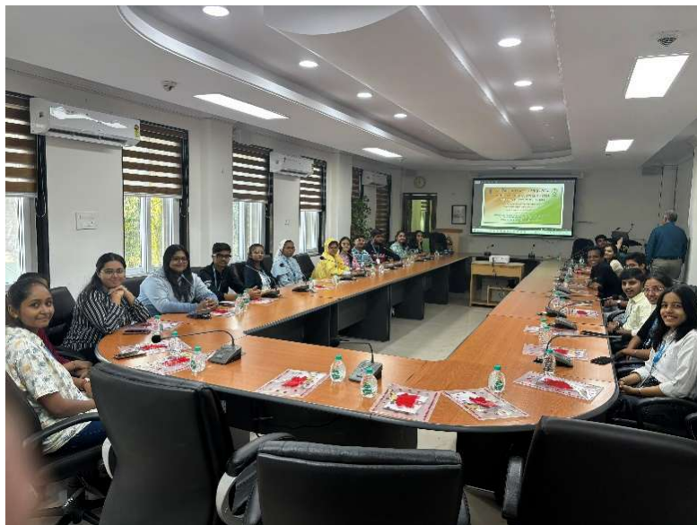
Student of Commerce Association