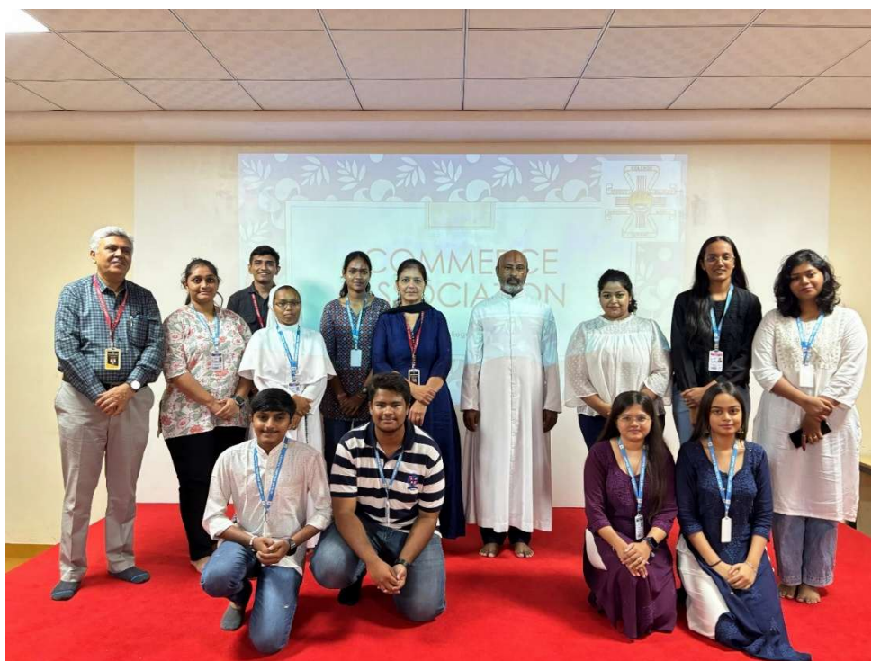
Committee Members of Commerce Association 2024-25

[3] Third Event was Group Discussion, conducted on 23 rd October, 2024.