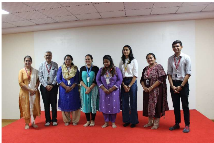
Winner of the Group Discussion e